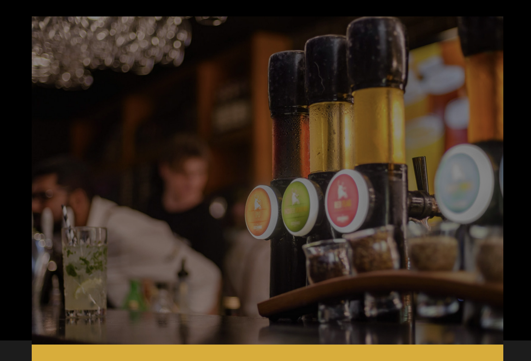
OPTION 1 - $29 PER PERSON Select 4 options from Category A and 1 option from Category B