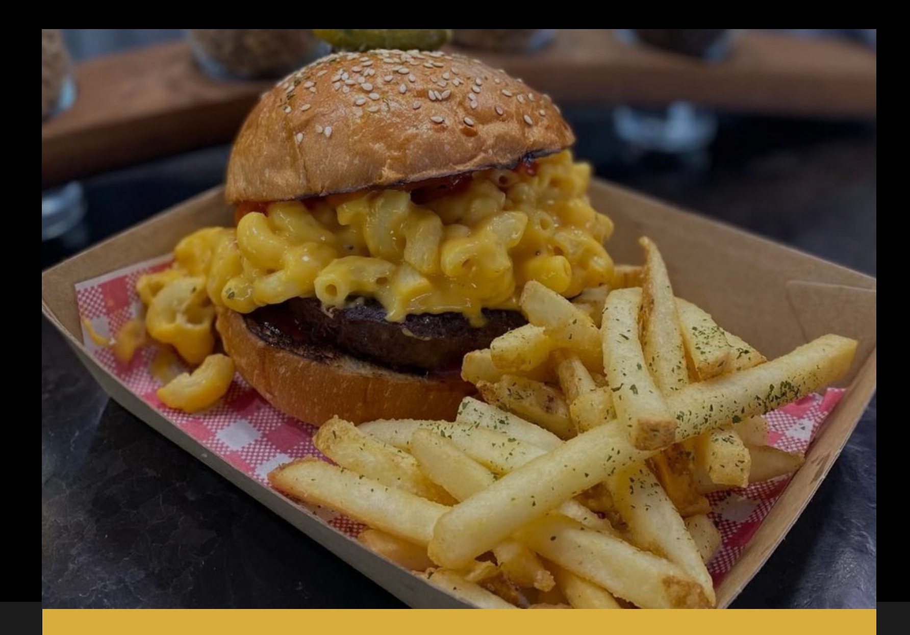
OPTION 3 - $49 PER PERSON

Option to add on additional Big Bites for $5 per person