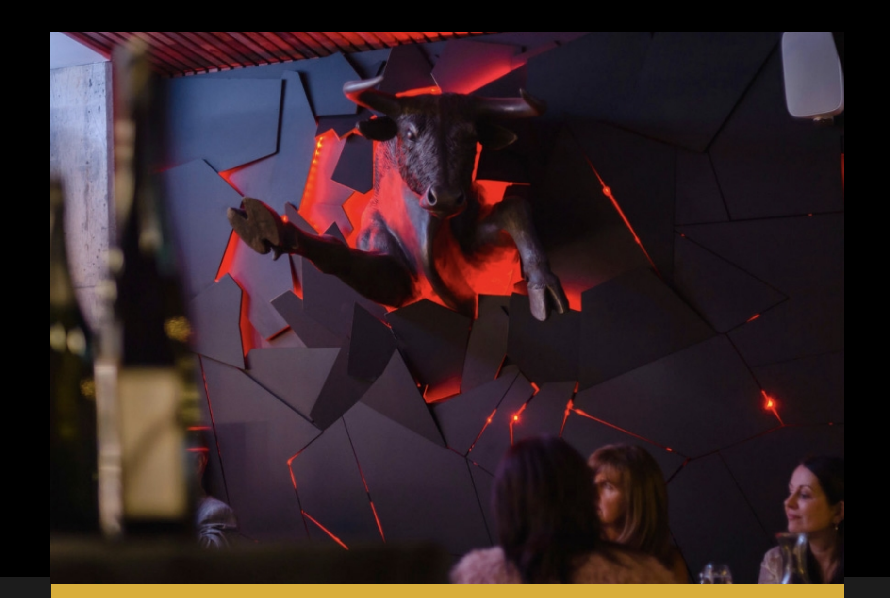
OPTION 2 - $39 PER PERSON Select 4 options from Category A, 2 options from Category B and 1 Big Bites

Option to add on additional Big Bites for $5 per person